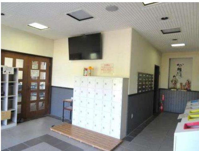
* Entrance hall