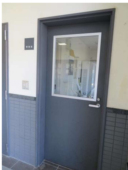
* Office room (No permanent staff is working here)