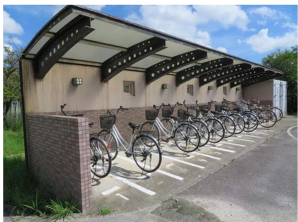
* Parking place for shared bicycles