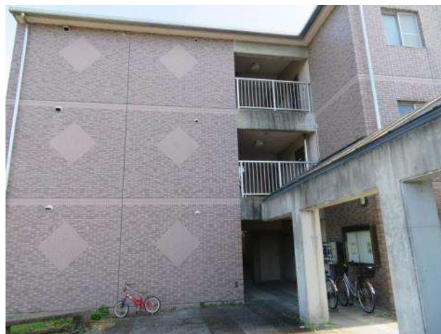
* Trunk room