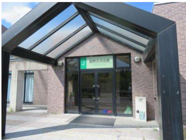
* Entrance hall